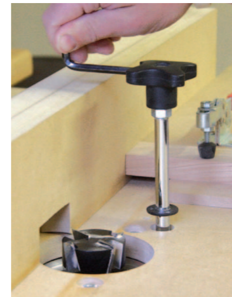
Plunge Depth of cut may be an issue if you have a thick router table or poor plunge stroke on your router