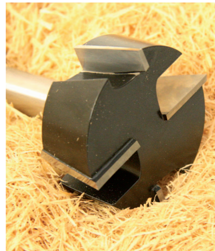
Skewed The four blades are alternately skewed to cut the shoulders of the tenon with a shearing action for a better finish