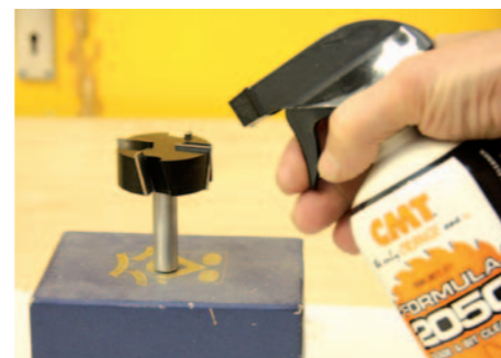
Cleaner We've found CMT's Formula 2050 to be superb for cleaning cutters. You will need to make a sled to cut tenons (below)